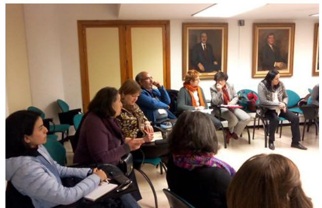
One of the pre-symposium working groups in Spanish

a critical mass to support the advancement of career development in our countries and regions