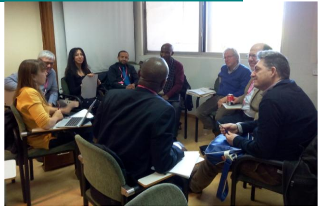
One of the pre-symposium Working groups in French

A Global pre-symposium brought together representatives of national and regional associations and organizations that were mostly IAEVG members.