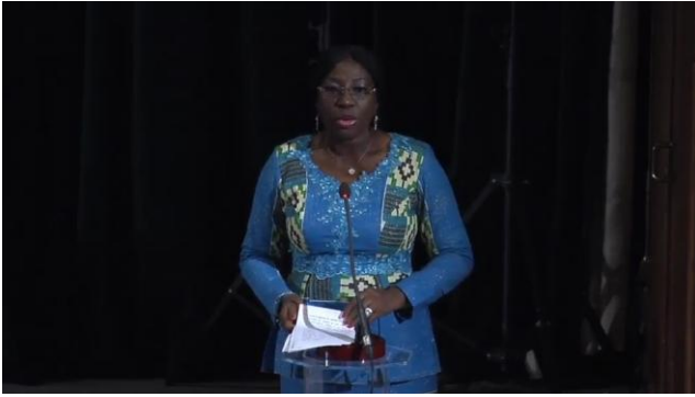
Ms Kandia Camara Minister of National Education of Côte d'Ivoire In her speech at the conclusion of the conference

Her address was directly related to the theme of the conference, the contribution of guidance for greater equity in education and in promoting and effect transition from education to working life..