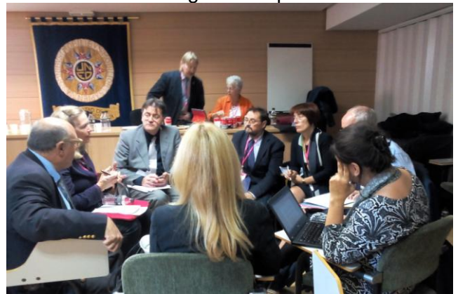
One of the pre-symposium Working groups In English

The symposium promoted one of IAEVG's major missions: to facilitate and improve communication among members and organizations in the field of educational and vocational guidance, but also to encourage the development of ideas, practices and research and collect and disseminate information on the latest research and guidance practices.